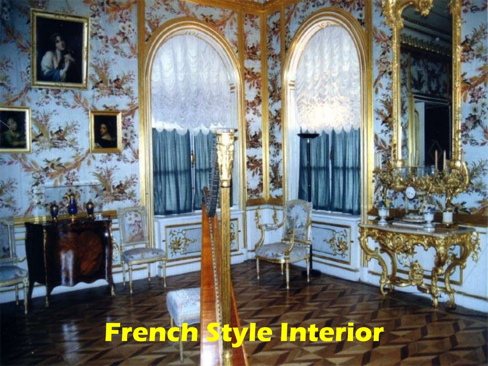
French Style Interior